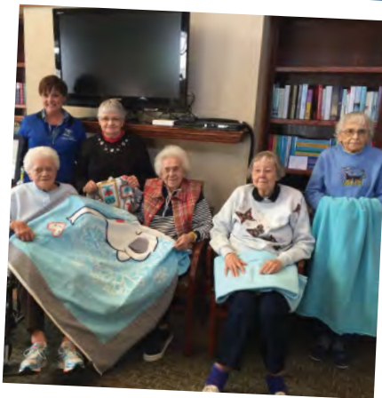
Willowbrook Operation Blanket