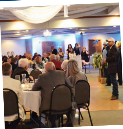
Enchanted Evening Fundraiser 2016