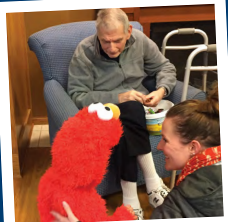
Trick-or-Treating at Syverson