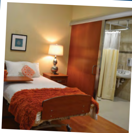
Prairie Pointe Rehab Suites