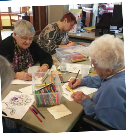
Coloring Party at Willowbrook